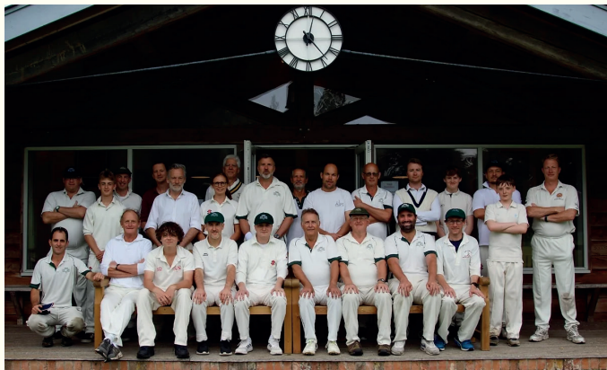
Club Photo 2023